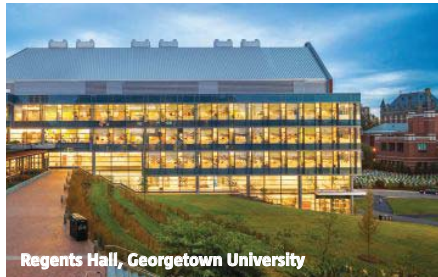
Regents Hall, Georgetown University