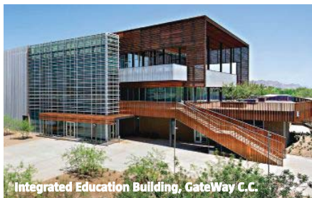
Integrated Education Building, GateWay C.C.