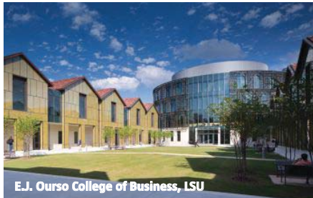
E.J. Ourso College of Business, LSU