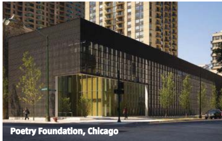
Poetry Foundation, Chicago