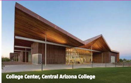
College Center, Central Arizona College